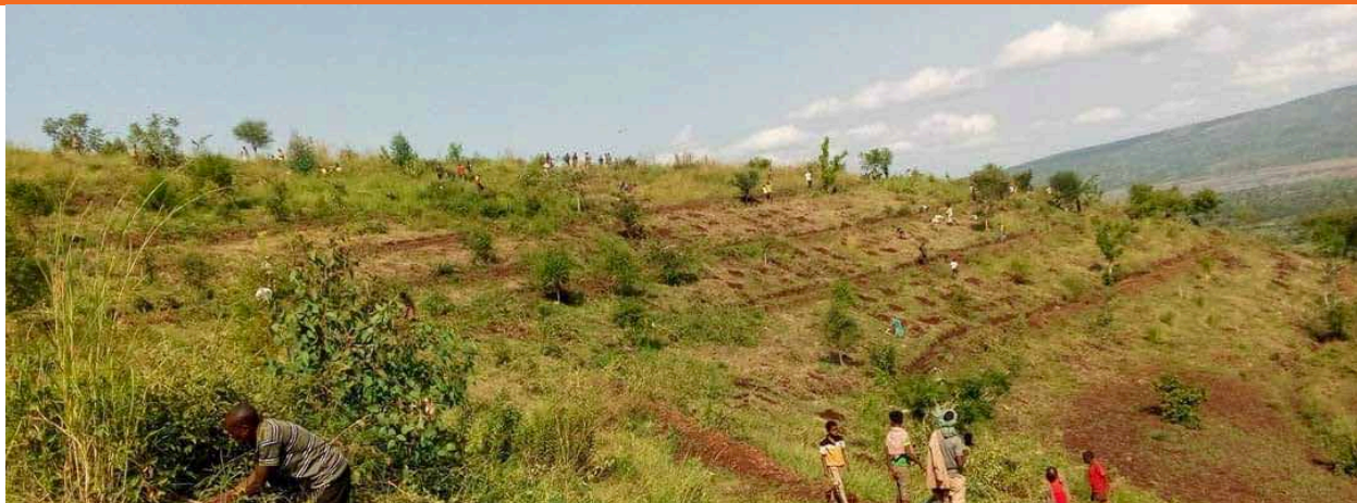
Habro woreda, Bareda kebele, Gara Adayo watershed (trenches)