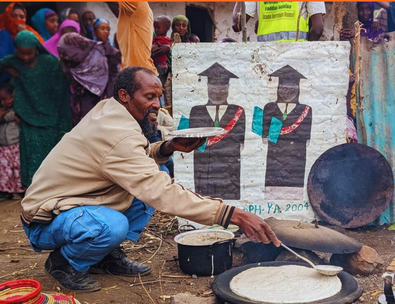
Men participate in cooking sessions.