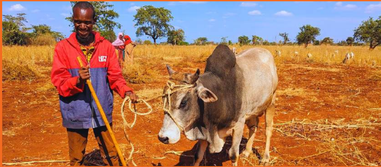
Program participants showcase livestock and poultry value chain as part of their Income generating activities.