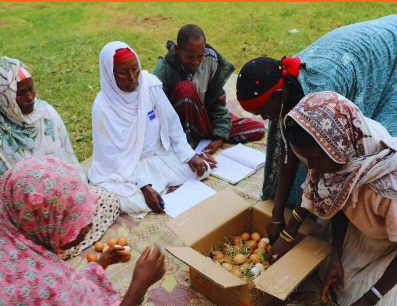
Birra Producer Marketing Group (PMG) contributing eggs for weekly sales.