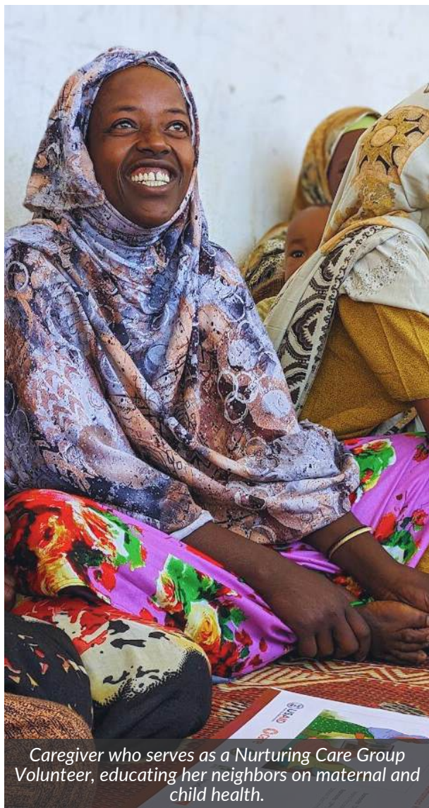
Caregiver who serves as a Nurturing Care Group Volunteer, educating her neighbors on maternal and child health.