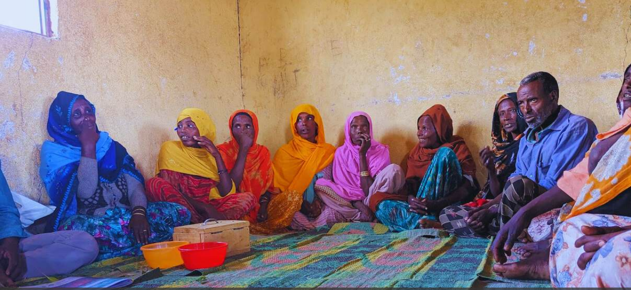
Program Participants attend a Village Economic and Social Associations (VESA) group meeting.

SPIR II deepens and strengthens livelihoods, leveraging and scaling promising practices from successful livestock value chain activities, linkages with private-sector input suppliers and micro franchising models and diversified on-farm and off-farm income pathways. Purpose 2 layers onto and sequences with Purpose 1 (P1) and Purpose 3 (P3). P1 and P2 for sustained nutrition security, as healthier households support deepened livelihood activities, which in turn create the own production and income necessary to support healthier households and positive nutrition behaviors. P3 and P2 together support reduced livelihood risk, with P3 addressing climate and shock-based risks, including access to water for multiple uses, while P2 focuses on building resilience through livelihood diversification along multiple pathways, including on-farm, off-farm, non-farm, and wage employment. SPIR II targets youth and women as part of a broader package to diversify and build resilience for all PSNP clients.