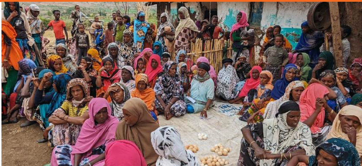
SPIR II participants gather to reflect on SPIR II programming, including the contribution of the poultry value chain activities.