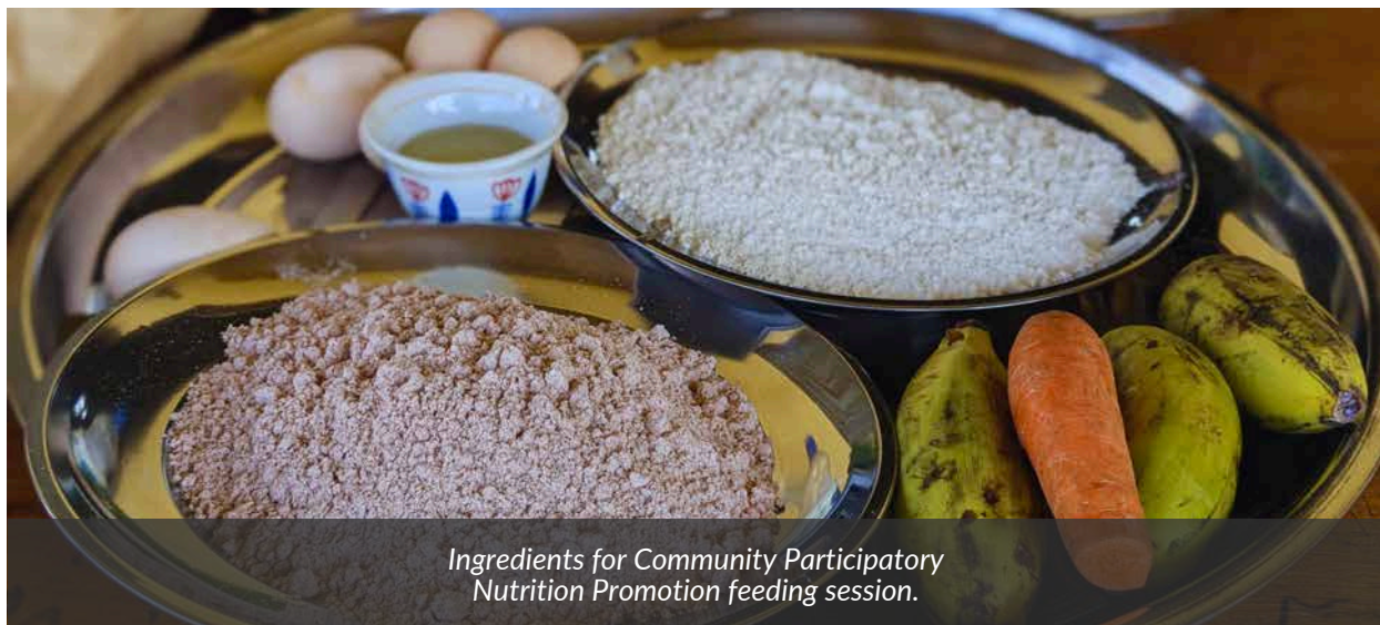
Ingredients for Community Participatory Nutrition Promotion feeding session.