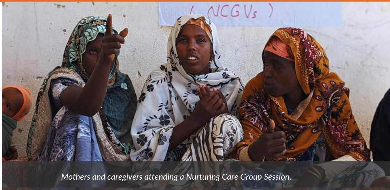
Mothers and caregivers attending a Nurturing Care Group Session.