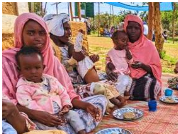
Caregivers and infants during Community Participatory Nutrition Promotion session.