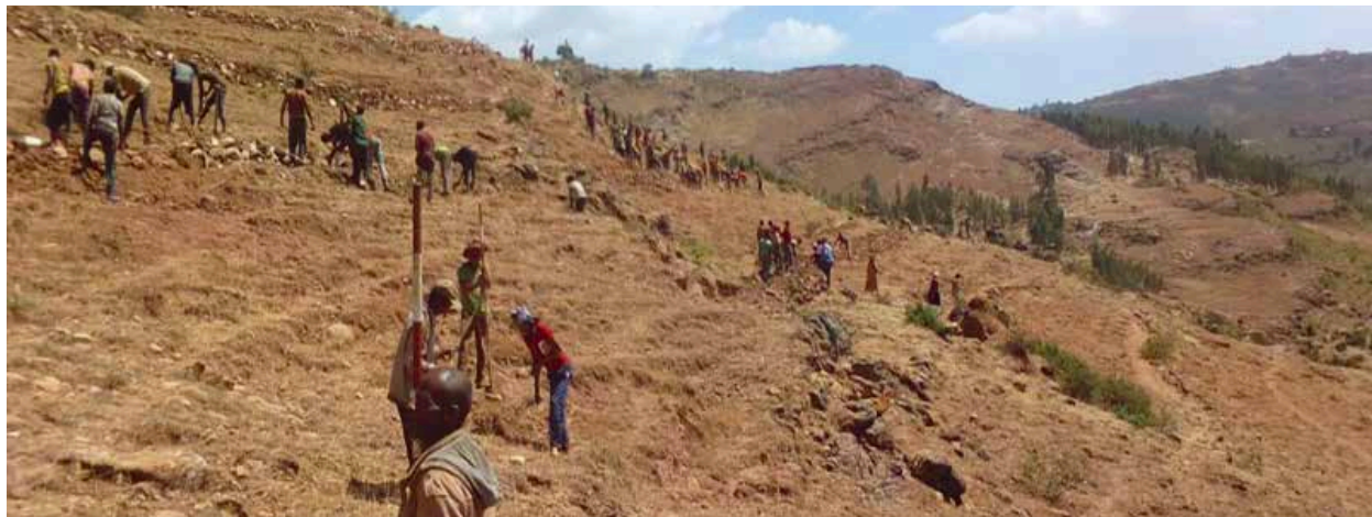
Habro woreda, Oda Anani kebele, Setegn watershed Ayo area closure (protected from human and livestock disturbances and hillside terraces)