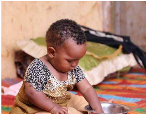
Child eating a nutritious meal.