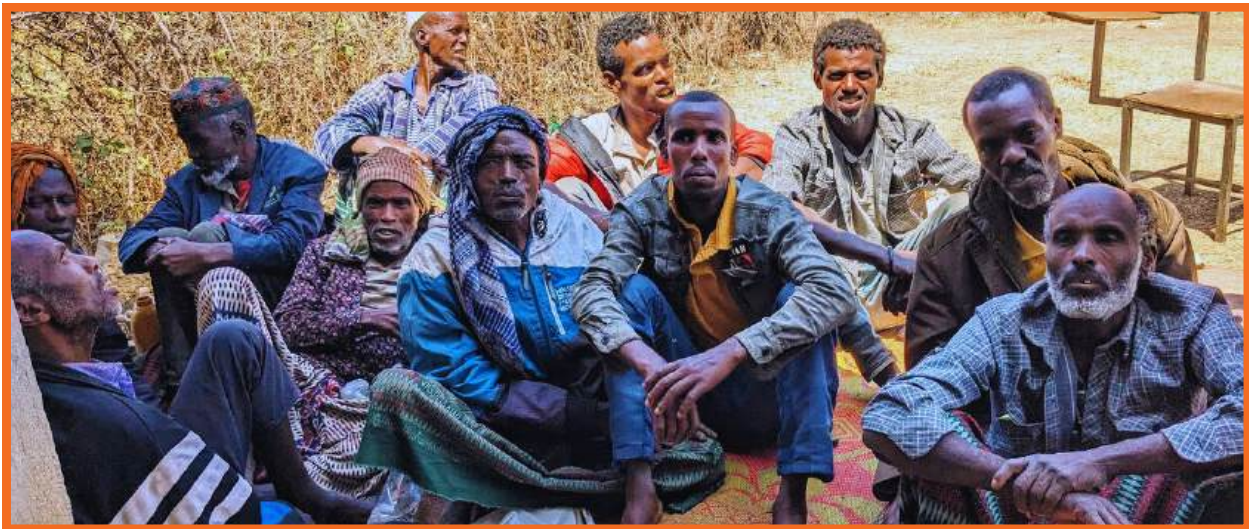
Men gather for a men's engagement session.