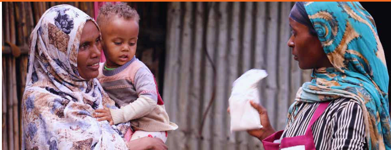
A micro-saleswoman who produces and sells nutritious mixed flour for improving child nutrition promoting her product to a mother in her community.