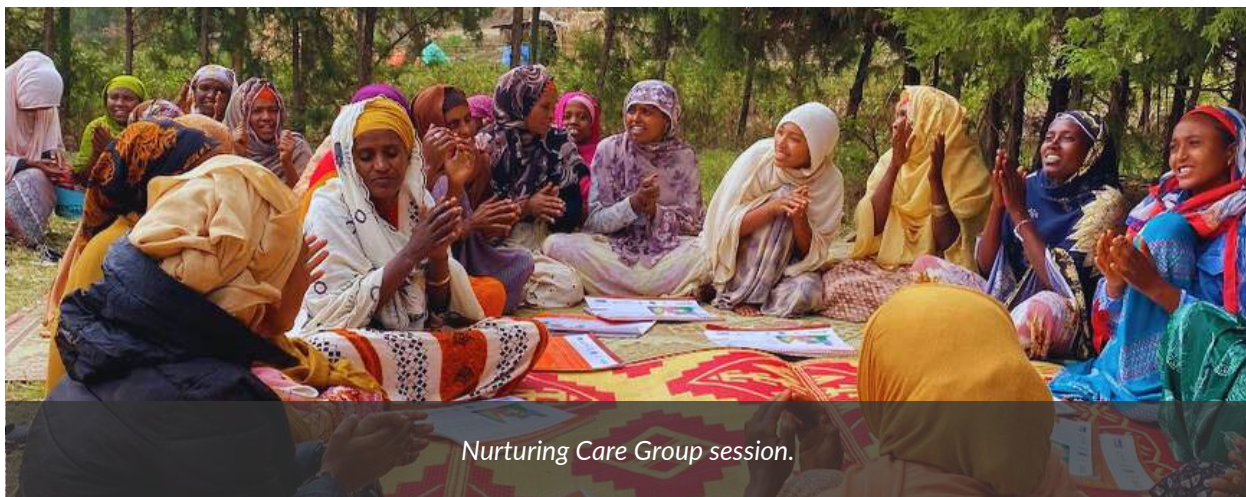
Nurturing Care Group session.