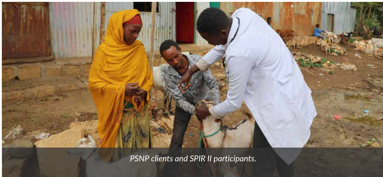
PSNP clients and SPIR II participants.