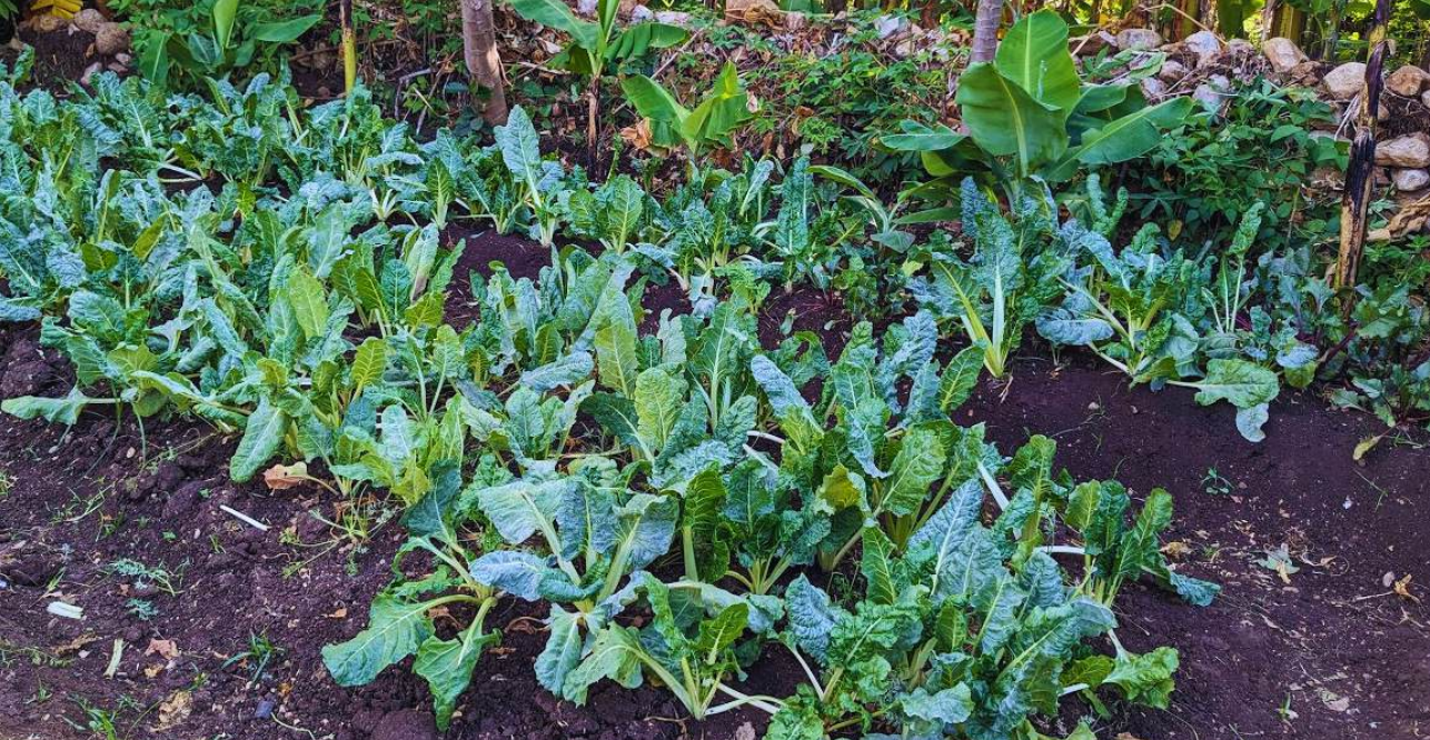
Program participant's home garden.

SPIR II supports the food and nutrition security of households, which is critical for achieving long-term resilience and graduation out of poverty by targeting pregnant and lactating women, children under two and communities with foundational interventions to improve health extensions, health seeking behavior, Infant and Young Child Feeding (IYCF) practices, dietary diversity, WASH and mental health support. Innovative approaches that have been adapted and tested include Nurturing Care Groups (NCG), Community-based Participatory Nutrition Promotion (CPNP), Group Management Plus (GPM+) and Men's Engagement Groups. SPIR II also provide Productive Safety Net Program (PSNP) commodity transfers to Public Works (PW) and Permanent Direct Support (PDS) clients.