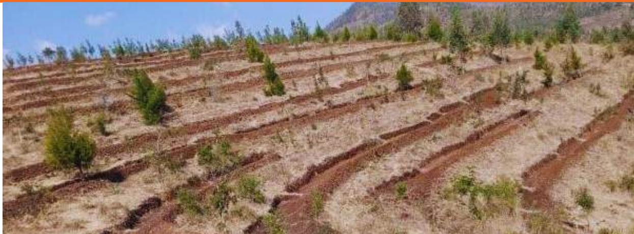
Habro woreda, Bareda kebele, Gara Adayo watershed (trenches)