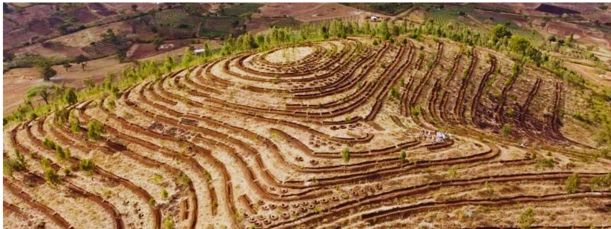
Habro woreda, Bareda Kebele, Gara Adayo watershed (Soil and water conservation structures, hillside terraces in degraded areas)