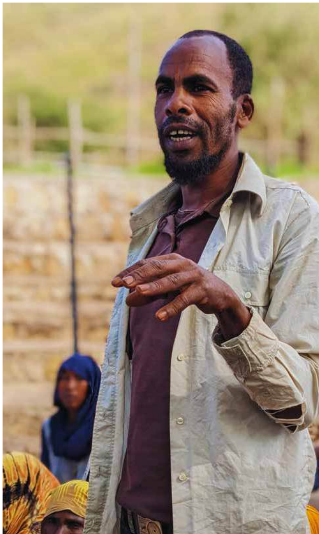
Community member reflecting on the benefits of a SPIR II-constructed waterpoint.