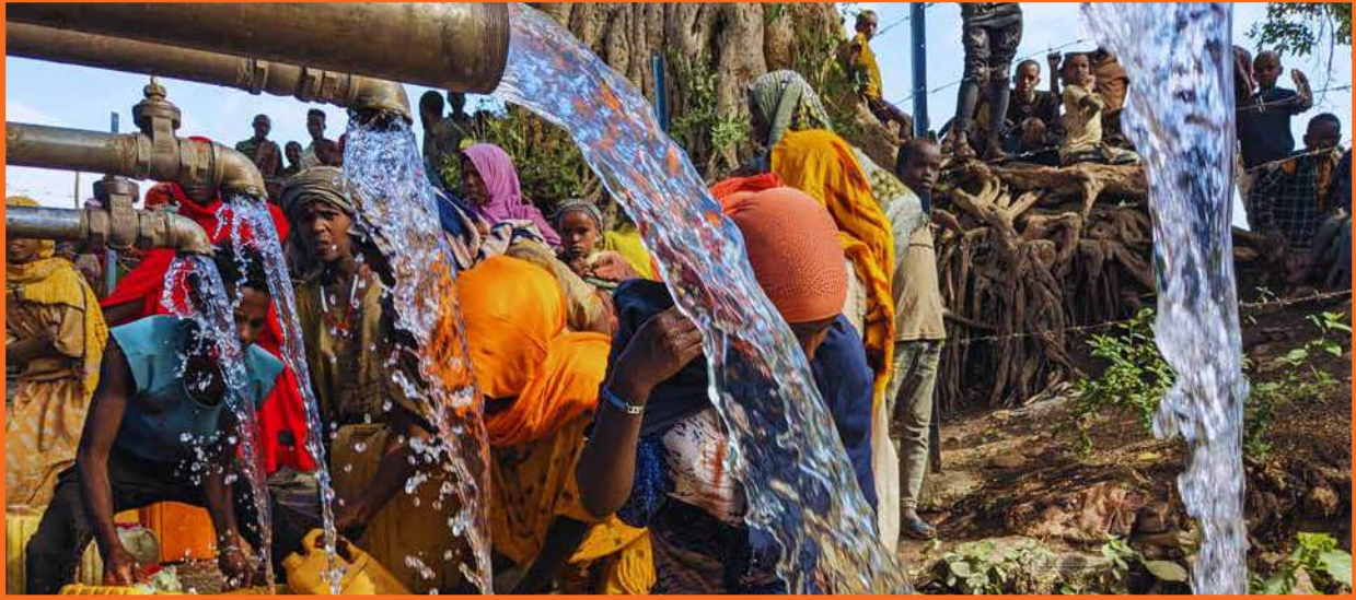
Community member collects water from a water point constructed by SPIR II.