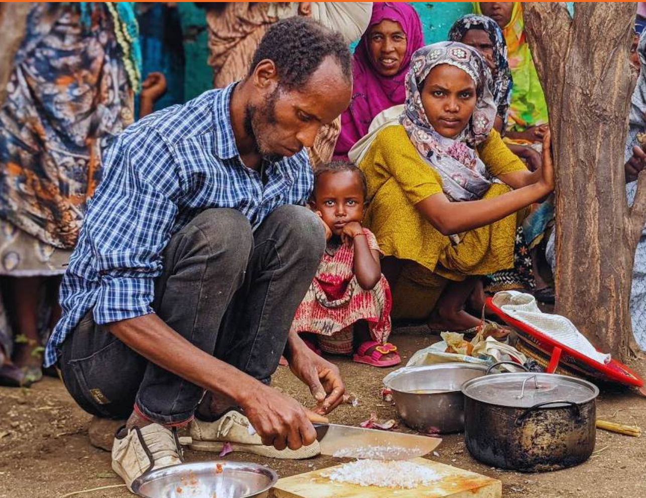
Men participate in cooking sessions.